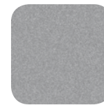
Aluzinc AZ 185