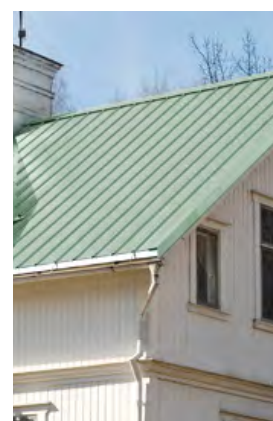
Plate Roof An ageless roof profile