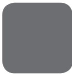
Graphite Grey RAL 7024