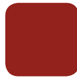
Wine Red RAL 3009