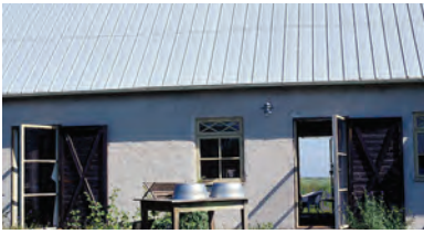
Plate Roof An ageless roof profile