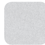
Silver RAL 9006