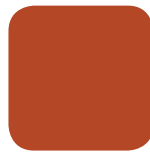
Brick Red RAL 8004